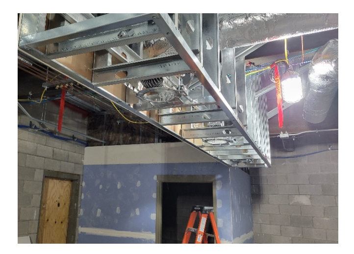
Main office soffit can lights installed