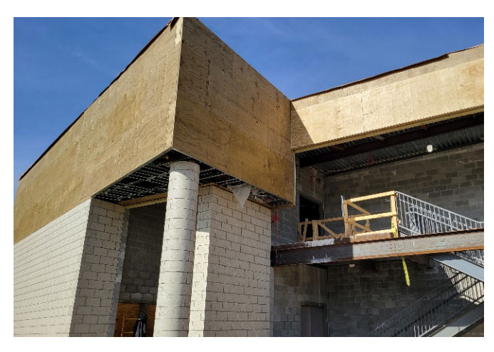
Plywood installed for metal panel locations