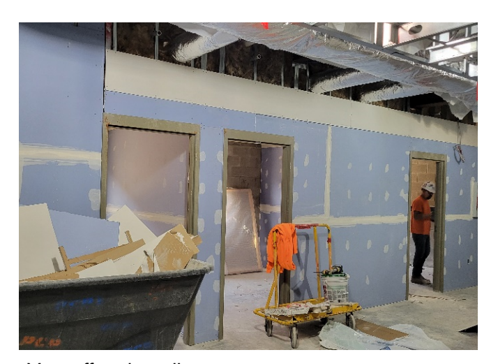
Main office drywall