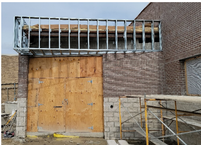
Metal framing at west end of building