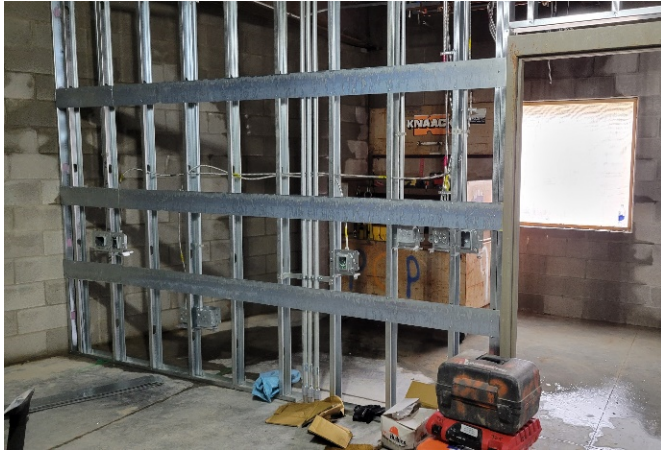
Front office wall framing